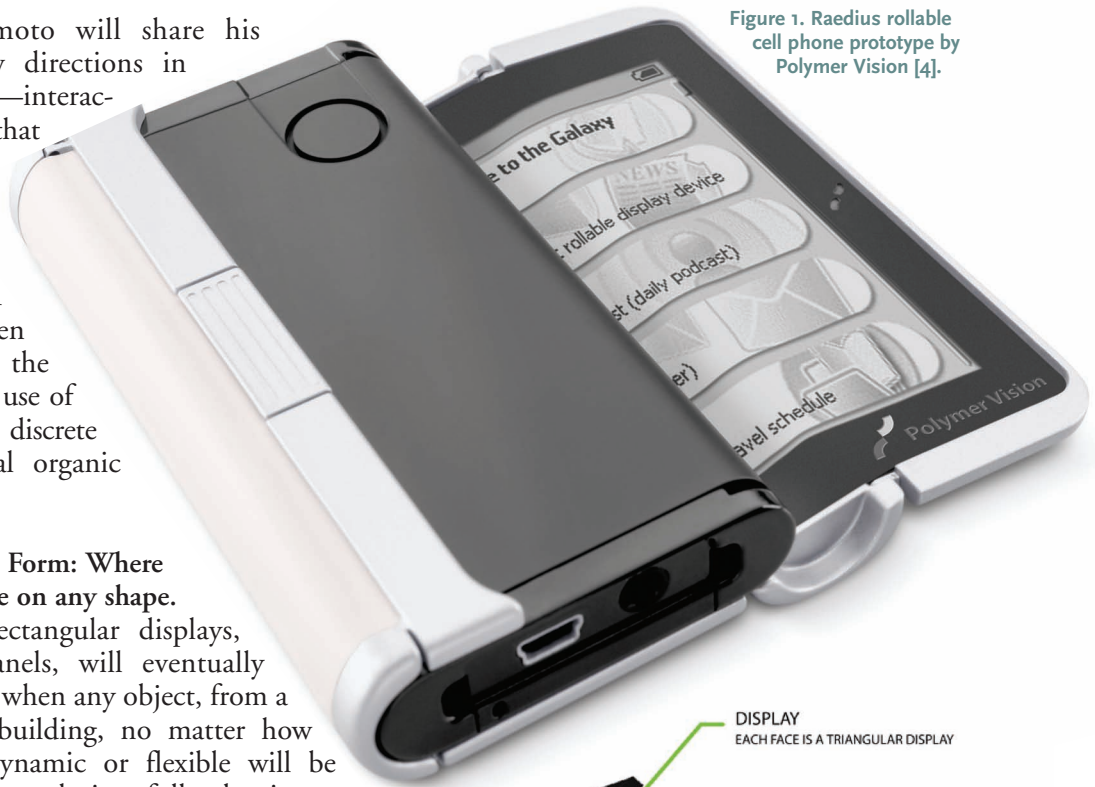
Figure 1. Raedius rollable cell phone prototype by Polymer Vision [4].

In the foreseeable future, the physical shape of computing devices will no longer necessarily be static. On the one hand, we will be able to bend, twist, pull, and tear apart digital devices just like a piece of