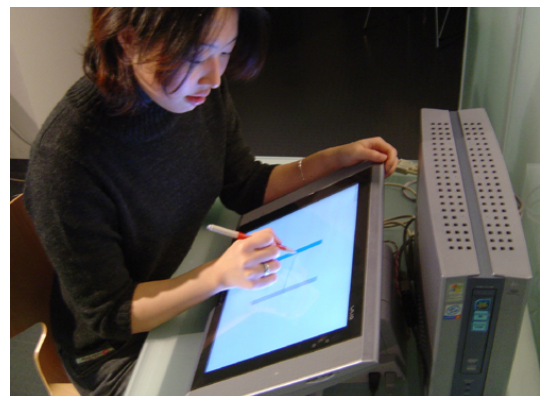
Figure 1: Prototype of tactile pen computer

Pen interaction is similar to touch screen interaction. However, pen input covers a wider range of devices, since it can be used both with touch screens and specialized pen input devices, such as Wacom TM interactive pen displays. The pen is very effective when fast, fluid and high precision two-dimensional input is required. Therefore artists and designers often use pen-enabled displays in painting and 2D layout applications. Pens are also used in mobile devices, such as tablet computers, as a replacement for keyboard, or with PDAs, where pen allows effective interaction despite their small screens.